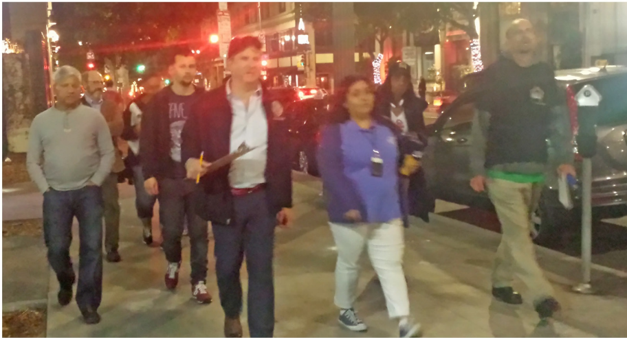
On Skid Row with other volunteers during the Greater LA Homeless Count.